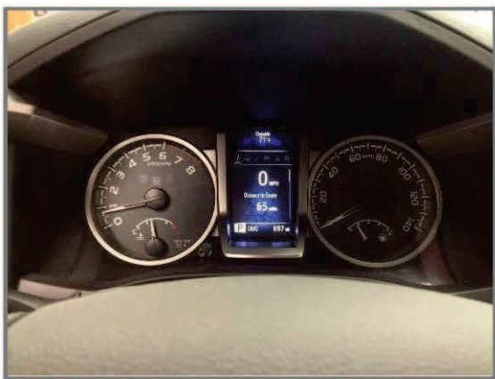
No MIL Illuminated

DTCs that are identified pre-repair should be considered to create a complete vehicle damage analysis report. If DTCs are identified post-repair, then they can be diagnosed and addressed before returning a vehicle to the customer.